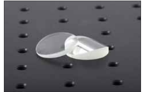
Photo representative of the Quality planoconvex cylindrical lenses range, and may not show the part 100 YE 25.