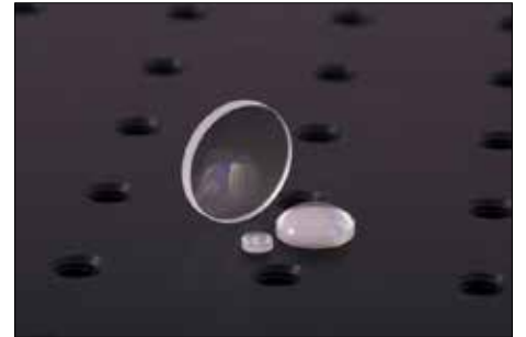
Photo representative of the High-index planoconvex laser lenses range, and may not show the part 160 PX 25.