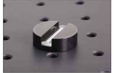
Photo representative of the Quality planoconvex cylindrical lenses range, and may not show the part 25 YE 25.