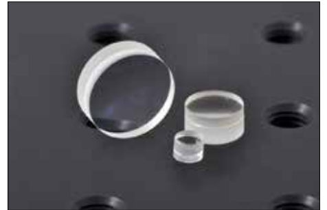
Photo representative of the Positive achromatic doublets range, and may not show the part 63 DQ 16.