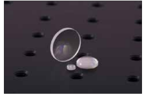
Photo representative of the High-index planoconvex laser lenses range, and may not show the part 63 PX 16.