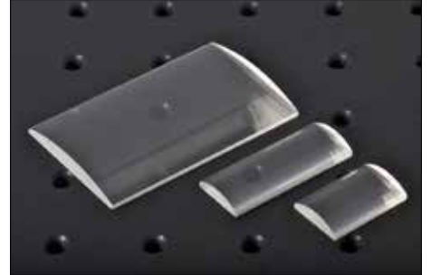
Photo representative of the Quality planoconvex cylindrical lenses range, and may not show the part 63 YB 40.